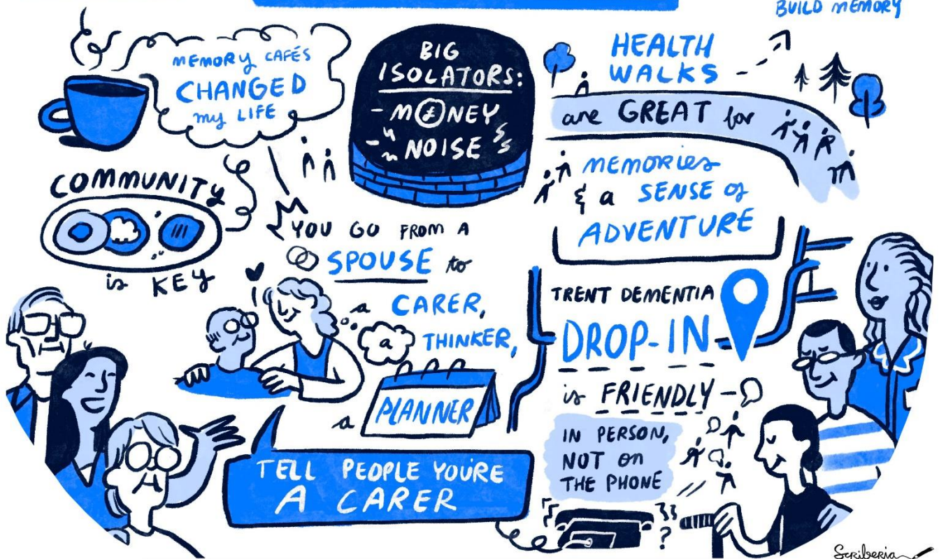
Figure 1@scriberian drawing containing quotes from people attending Trent Dementia's activities

WALKING 5 MILES A MONTH HELPS BUILD MEMORY