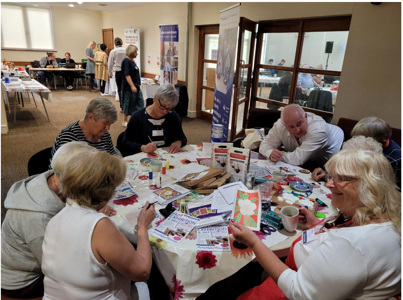
Figure 3 Memory Cafes and groups provide stimulation and support for everyone affected by dementia

Lastly, don't overlook the option of respite care . This provides a short break for the person with dementia, either at home or in a care setting, while you take some time for yourself. Respite care can be invaluable in allowing caregivers to recharge and focus on their own wellbeing.